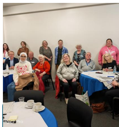
Placement Student Keele University

The placement strengthened my appreciation for empathetic listening, patient advocacy, and the importance of using lived experience to drive meaningful improvements in healthcare services."